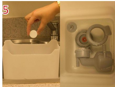
5 Dissolve an Egro Milk System Cleaning Tablet in a container with warm water. Place pieces of the mixer unit into the solution. Allow to soak for at least 1 hour.