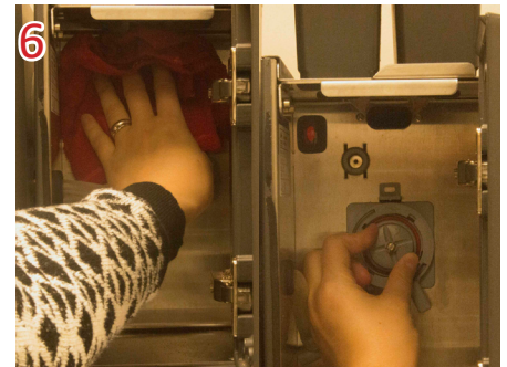
6 Wipe the powder module with a clean damp towel. Remount the knob and the ring back into the powder module pushing firmly until it clicks.