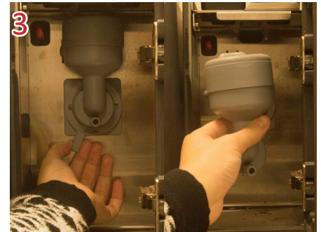
3 Unlock the mixer by turning the knob to the right. Take the mixer unit out.