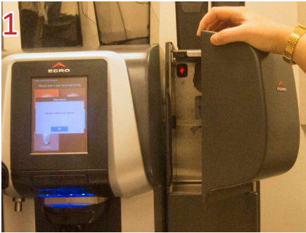
1 Open the front door of the powder module.