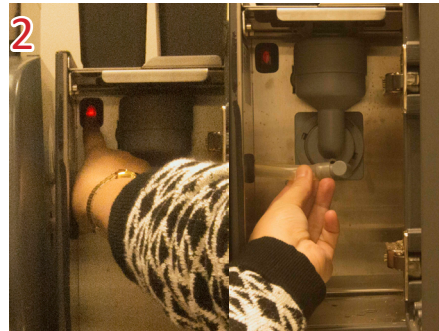
2 Press the power button to switch off the powder module. Pull out the tube connected to the mixer.