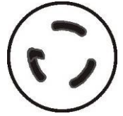
Nema L6-30 Twist